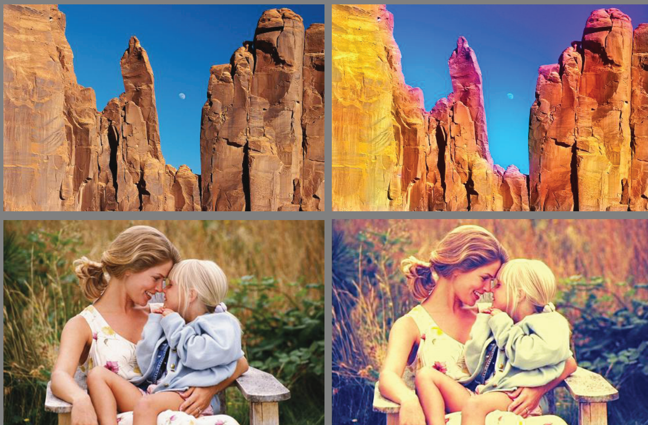
Figure 4: Two different styles of enhancement learned from photographers. left: original photos, right: enhanced results.