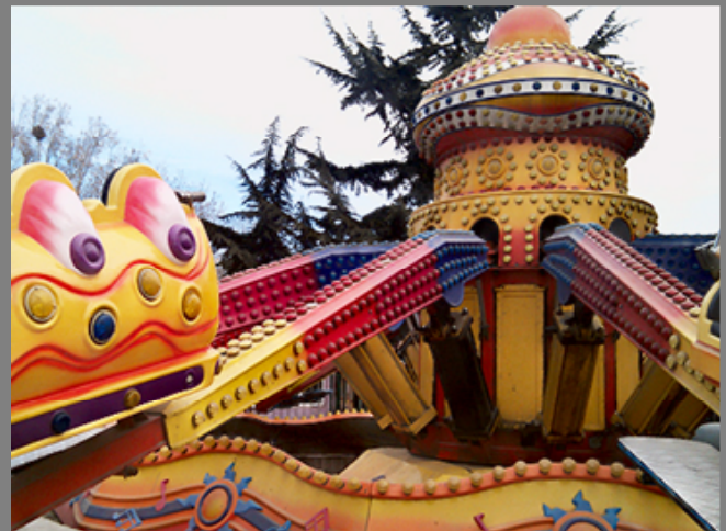
Figure 3: Another two enhancement examples. Left: Original photos. Right: Enhanced results. The top one was taken by iPhone 3G while the bottom one was taken by Android Nexus One.