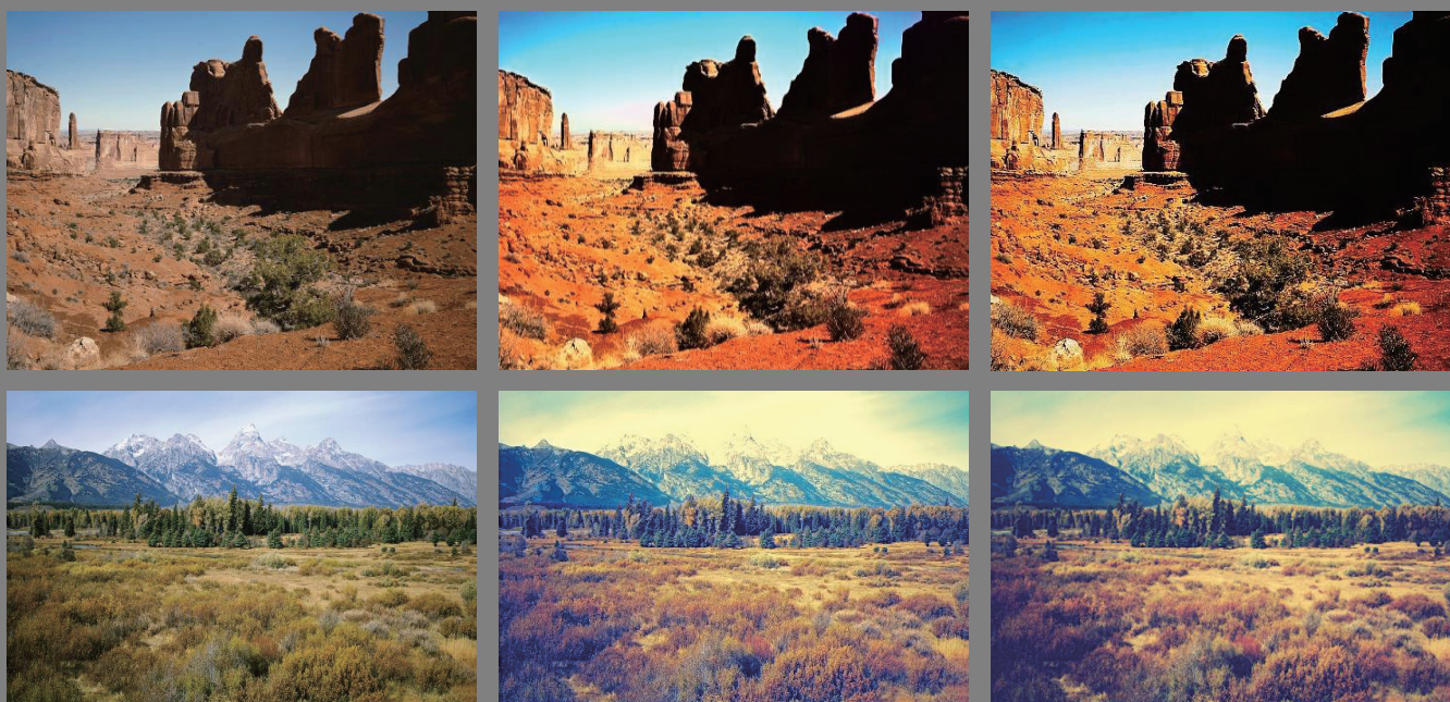
Figure 5: Comparison between our automatically enhanced results and manually enhanced results by a photographer for the two different styles. The manual result was not part of the training data. Left: original photos. Middle: our results. Right: results by Photographer. Note that our models were learnt from the same photographer, indicating the consistency between our learned models and the photographer's implicit styling rules.