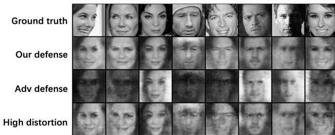
Fig. 2. The reconstruction results of an adaptive attack with our basic defense (the second row) and improved defense (the last two rows).

Figure 2 and Table II shows the result in an adaptive attack setting. The first row is the ground truth image. The second row demonstrates the reconstructed image of an adversarial training inversion model. Attackers can generate more realistic face images using adversarial training with knowledge of our defense and related parameters. The reconstruction error of our defense is still larger than the baseline. Therefore our defense can prevent attackers from generating accurate face images even when attackers know the mechanism and parameters of our defense.